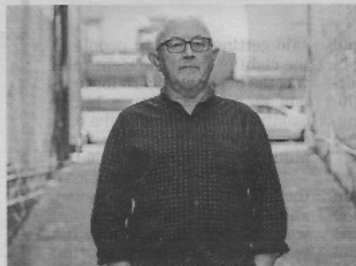
Sir Dave Dobbyn will perform at White Out Festival in Methven tomorrow.

The 30-metre space man has been a popular feature at previous Illuminate light and sound events.